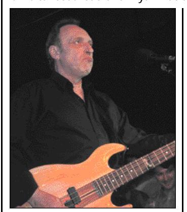
It's not only dogs who get to look like their owners. Some bass guitars evidently do too.